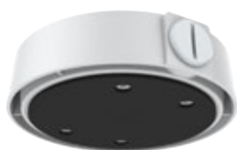
A22a Junction Box