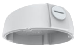
A22b Junction Box