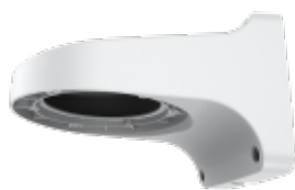
A28 Wall Mount