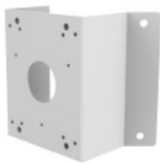
A35 CORNER MOUNT