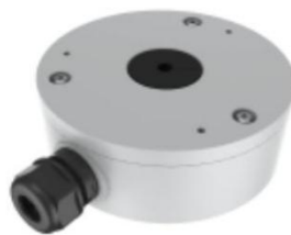
TC-P54BM SPEC: V5 JUNCTION BOX