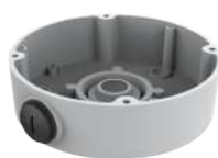
TC-P54BM Spec: V3 Junction Box