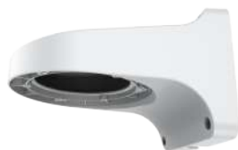
A28 Wall Mount