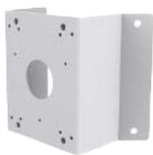
A35 CORNER MOUNT