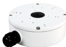
A22 Junction Box