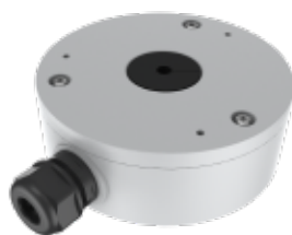
TC-P54BM SPEC: V5 JUNCTION BOX