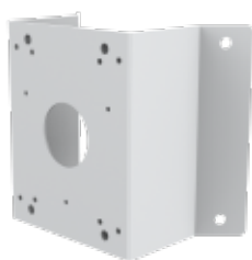
A35 CORNER MOUNT