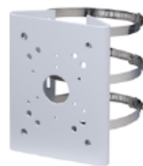
A36 POLE MOUNT