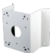
A35 Corner Mount