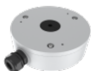
TC-P54BM Spec: V1 Junction Box