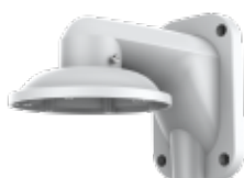
A25 Corner/Pole Mount