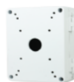
811 Junction Box