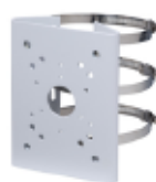
A36 Pole Mount