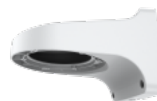
A28 Wall Mount