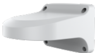
A29 A29 WALL MOUNT