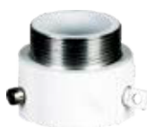
A37 Installation Adapter