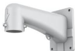
DF20Y Wall Mount