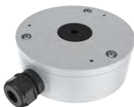
TC-P54BM SPEC: V5 JUNCTION BOX