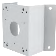
A35 CORNER MOUNT