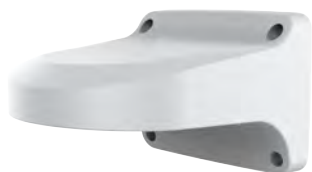
A29 A29 WALL MOUNT